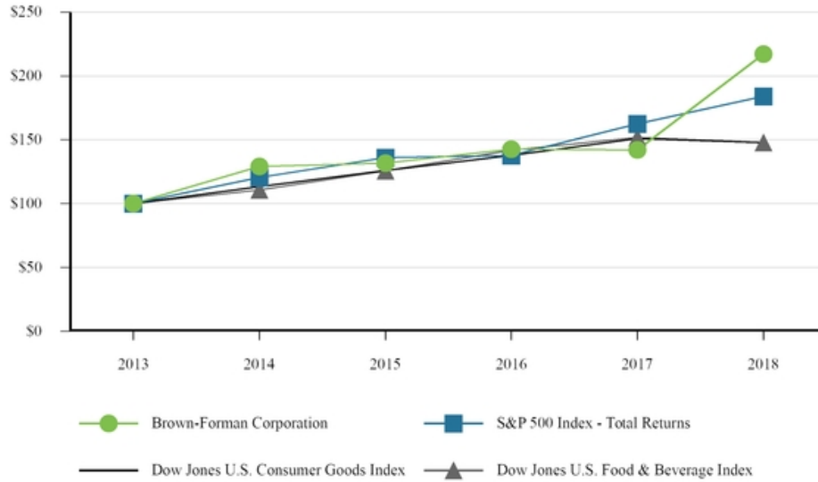
Five-Year Cumulative Total Shareholder Return Assumes Initial Investment of $100 (as of April 30, 2018; dividends reinvested)

The graph below compares the cumulative total shareholder return of our Class B common stock for the last five years with the Standard & Poor's 500 Index, the Dow Jones U.S. Consumer Goods Index, and the Dow Jones U.S. Food & Beverage Index. The information presented assumes an initial investment of $100 on April 30, 2013, and that all dividends were reinvested. The cumulative returns shown represent the value that each of these investments would have had on April 30 in the years since 2013.